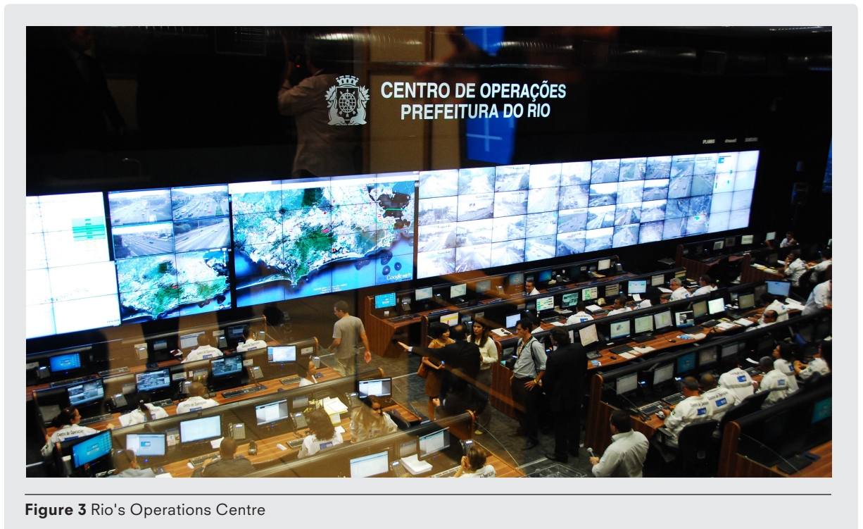
Figure 3 Rio's Operations Centre

Similar operations centres have now been built in various cities by other companies, reproducing a concept originally designed by IBM. 29 In Jakarta, the Smart City Lounge is a space for the city administration that contains a monitoring room, similar to the Rio Operations Centre. 30 Data from the navigation app Waze, CCTV footage and reports from the public can be visualised in the monitoring room. This data is also analysed to anticipate problems before they happen. 31