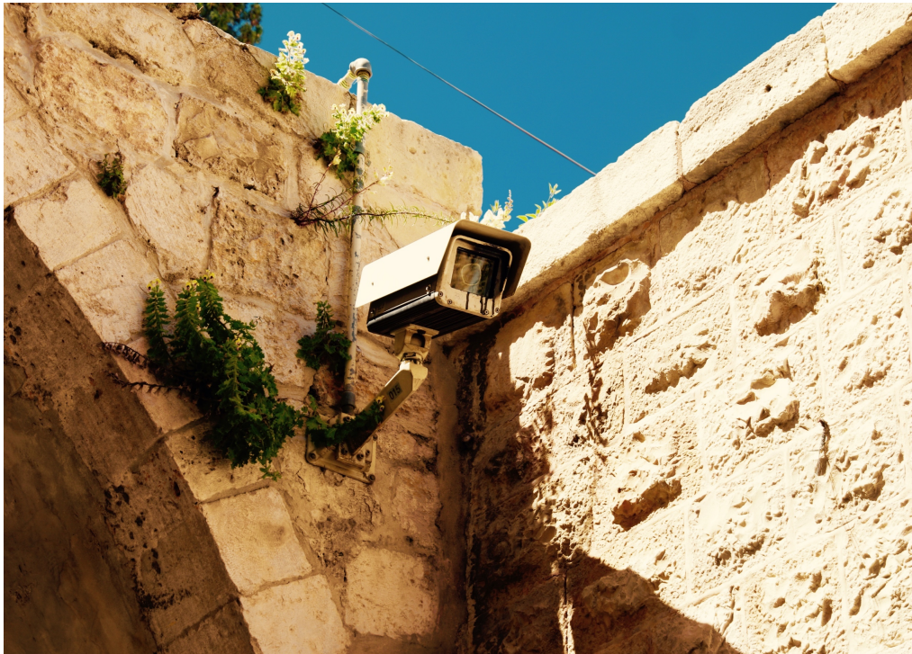
Figure 4: Surveillance Camera in Jerusalem's Old City

According to reports, it is nicknamed "Google Ayosh", where "Ayosh" is a Hebrew acronym that describes the occupied Palestinian territory and "Google" denotes the technology's ability to search for people's faces with the same ease as a keyword search on Google. (Google is not actually involved in this project.) 30 AnyVision's software also performs heat mapping. 31 A recent development in AI video surveillance, heat mapping uses "algorithms to detect unusual movements and crowd formations" as well as traffic patterns. This technique has particularly worrying implications for Palestinians' right to protest and assemble. 32