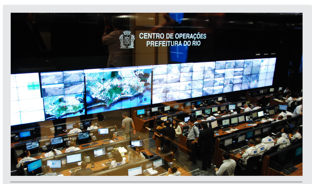
Figure 3 Rio's Operations Centre

Similar operations centres have now been built in various cities by other companies, reproducing a concept originally designed by IBM.<sup>29</sup> In Jakarta, the Smart City Lounge is a space for the city administration that contains a monitoring room, similar to the Rio Operations Centre.<sup>30</sup> Data from the navigation app Waze, CCTV footage and reports from the public can be visualised in the monitoring room. This data is also analysed to anticipate problems before they happen.<sup>31</sup>