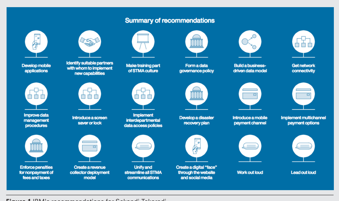
\textbf{Figure 1} \ \mathsf{IBM's} \ \mathsf{recommendations} \ \mathsf{for} \ \mathsf{Sekondi-Takoradi}

The Metropolitan Assembly of Sekondi-Takoradi in western Ghana approached IBM in 2015 with the broad objective of "improving living conditions for citizens." IBM's recommendations, after its 2016 intervention, are summarised in the infographic below.<sup>26</sup>